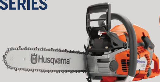
HUSQVARNA 550 XP®