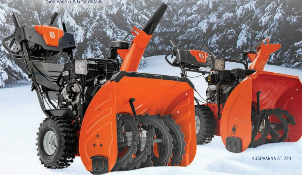
HUSQVARNA ST 424