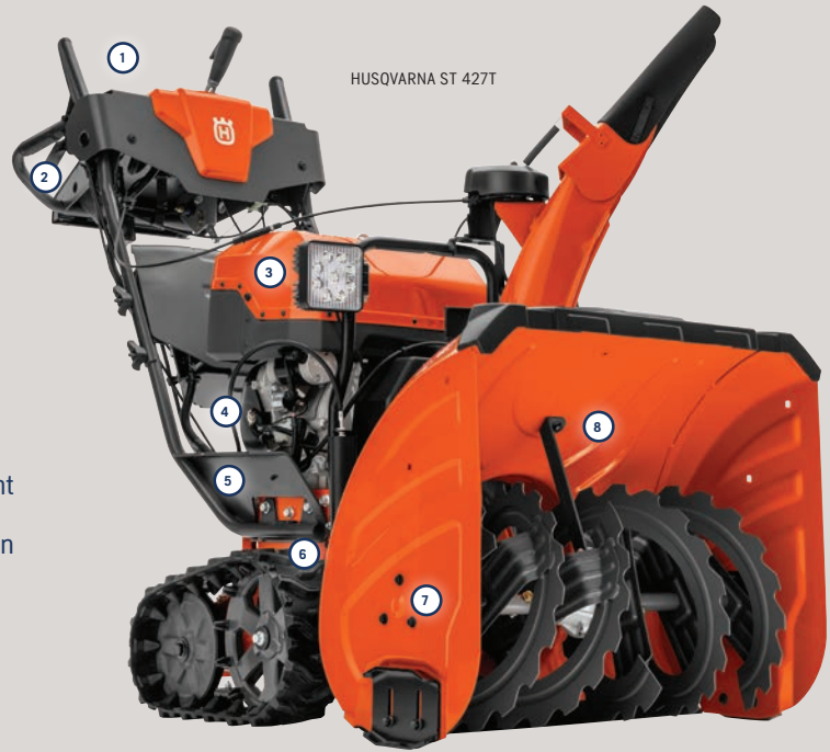
HUSQVARNA ST 427T