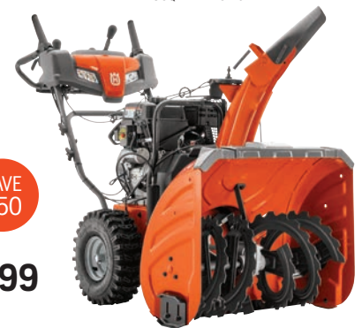
HUSQVARNA ST 324