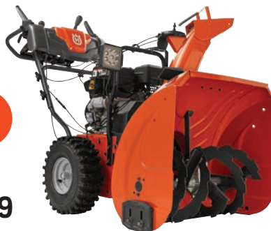
HUSQVARNA ST 224