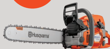
HUSQVARNA 572 XP®